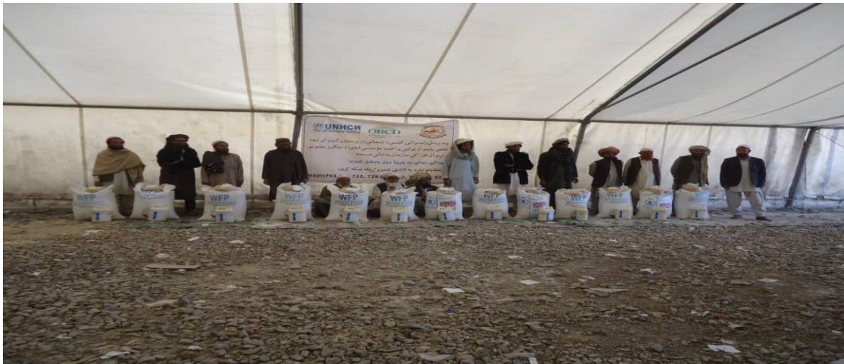
Beneficiaries receiving WFP food assistance in Barmal district of Paktika province

ORCD was responsible for offloading, warehouse management, repackaging, handling, crowd controlling, coordination with stakeholders, reporting to WFP and execution of distribution process of food items provided by WFP to direct target beneficiaries.