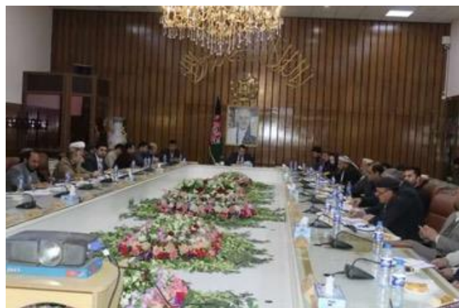
Figure 2: Provincial Reintegration committee meeting Balkh Province .