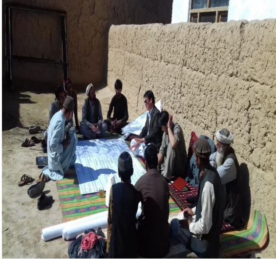
Figure 1 : Reviewing Khwaja Alwan community's CDC plan

In partnership with IOM ORCD started Community Based Activities (Social and Psychosocial Aspects of Sustainable Reintegration) of RADA Project in Baghlan Province. The overall Goal of the project is: To contribute to the progressive achievement of Sustainable Development Goal (SDG) 10.7, “to facilitate orderly, safe, regular, and responsible migration and mobility of people including through the implementation of planned and well-managed policies”. The specific objective of the project is: To support Afghan returnees, their families and host communities towards sustainable reintegration in Afghanistan