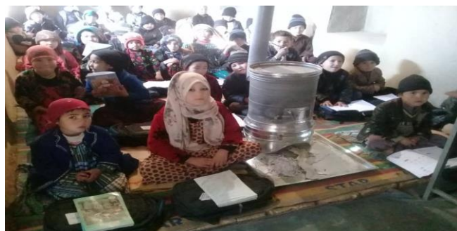
Figure 2 : CBE center at Shurtepa district of Balkh Province