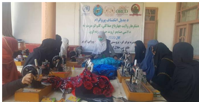
An action view of Handicrafts Training Center established by BADILL in Nangarhar province

The project will continue during 2020 with expansion to other districts of Nangarhar, Paktya and Paktika provinces with extended targets