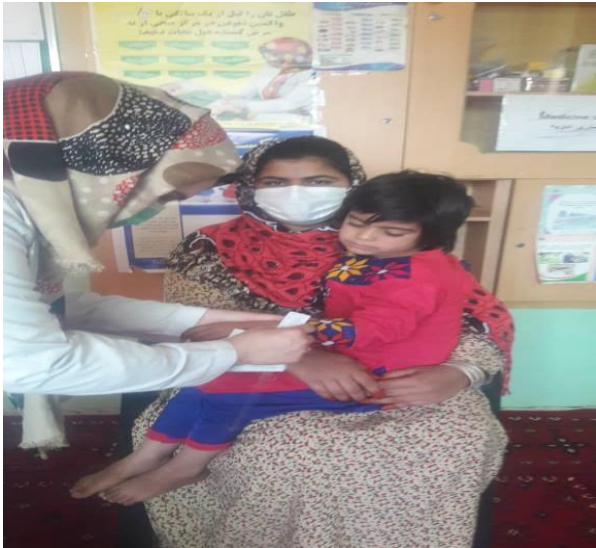
Figure 1: WPC Health worker examining a sick client in Baghlan center

WPC was operated in close coordination with relevant stakeholders. WPC and DoWA staff were provided capacity building around relevant topics. Throughout 2019, WPC in Baghlan accommodated 119 women accompanied by 27 children who were provided psychosocial counselling, legal aid, literacy trainings and vocational trainings aimed at women economic empowerment. Out of the entire number of clients, cases of 89 clients were resolved through mediation and court, were discharged from WPC and reintegrated to their families.