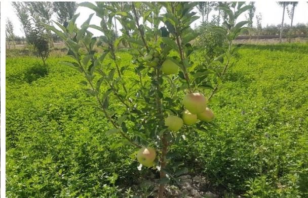
Fruit bearing by saplings distributed through BADILL in Paktika province in 2019

of new apple orchards and vineyards, 300 Jeribs of land was covered by licit crops.