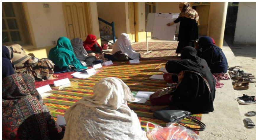
Cluster leadership training conducted for cluster member in Majbor Abad village of Jalalabad city

members were identified through wealth ranking exercise of participatory vulnerability assessment in target villages. ORCD's Community Facilitators, Business Development Trainer and Team Leader have received initial and refresher trainings about CBSG manual, leadership skills, CBSG accounting, CBSG membership as well as CBSG clustering, cluster subcommittees and governance committee, grievances redressal mechanisms, rapid market assessment and other relevant topics that were conducted by dedicated trainers of AKF in Baghlan and Nangarhar provinces.