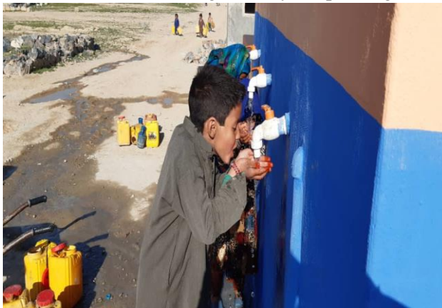
Kids happily fetching safe drinking water at closest distance to their homes

and solar water pumps will be installed for filling the water tank. As per the contract, 8 water taps will be installed for water collection by beneficiaries. Pipe-scheme will be community contribution which the community could establish connection for carrying water to houses living nearby depending on