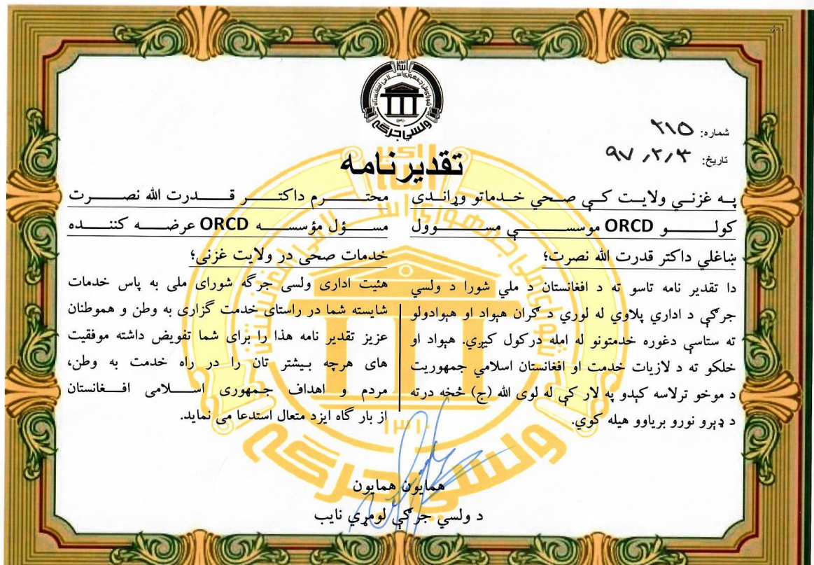
Lower House of the Parliament Appreciating ORCD's activities in Afghanistan