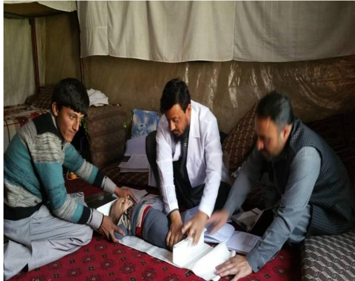
Figure 1 : Recording Z-Score for Malnutrition baby

ORCD deployed staff as per guidelines introduced by MoPH for three mobile nutrition teams (1 midwife, nutrition officer and support staff) and one emergency mobile health team (1 MD, Midwife, vaccinator and support staff) serving underserved areas in the districts (Paroon, Wama and Nurgram). The mobile nutrition teams worked in the areas beyond the reach of the existing health facilities as part of nutrition mobile activity. The mobile teams were greatly needed because the existing BPHS did not have any mobile health team while there was drought