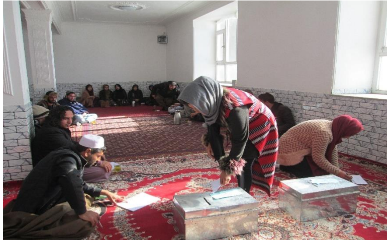
7Khuja Umari CCDCs election in Ghazni Province

Moreover, linkages of the elected Community Development Councils were built with District Governors, sectorial government departments, INGOs, NNGOs, Civil Societies and Youth Organizations at district and provincial level.