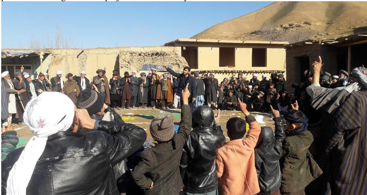
Figure 1 : CLTS Triggering in Saripul Sozma Qala District

In partnership with FHI360, ORCD embarked on implementation of Community Led Total Sanitation in SarePul and Zabul provinces in April 2018 and ended in April 14, 2019. The project aims to mobilize and sensitize communities to achieve an open defecation free (ODF) villages in all target districts of the target provinces. During the life of project 138 community certified as ODF.