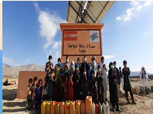
Beneficiaries praying for sake of having safe drinking water at their village after the project completion