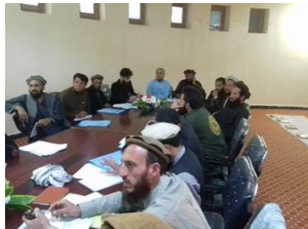
Figure 3 Rational Medicine use training