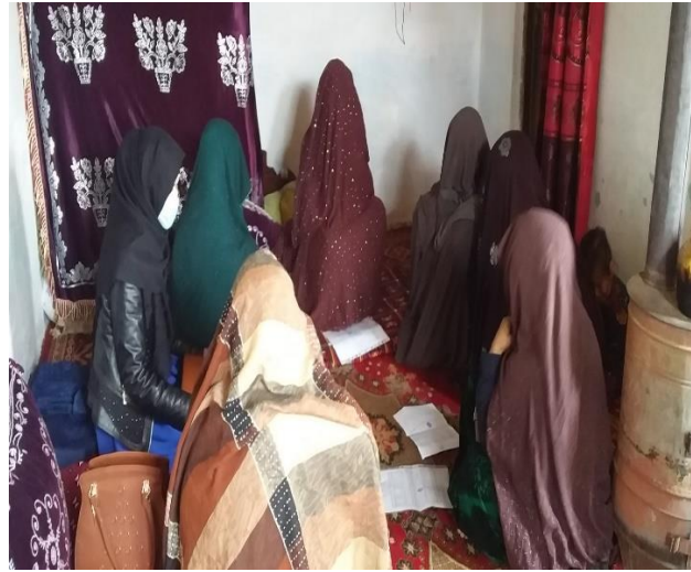
Figure 2 : Referring females with psychosocial needs to the respected clinic in Nawabad Baghlan-e-Markazi