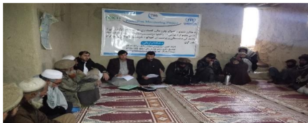
6ORCD protection monitoring team during conducting Focus Group discussion with Pakistani Refugees in Gullan Refugee Camp

In 2019 ORCD carried out protection monitoring of refugees from North Waziristan Agency of Pakistan in Khost and Paktika provinces using standard processes and tools provided by UNHCR. Through this intervention, ORCD was able to reach out over 20,000 women, men, boys and girls of both refugee and host communities in both target provinces and achieved the target set forth with a 100% success rate.