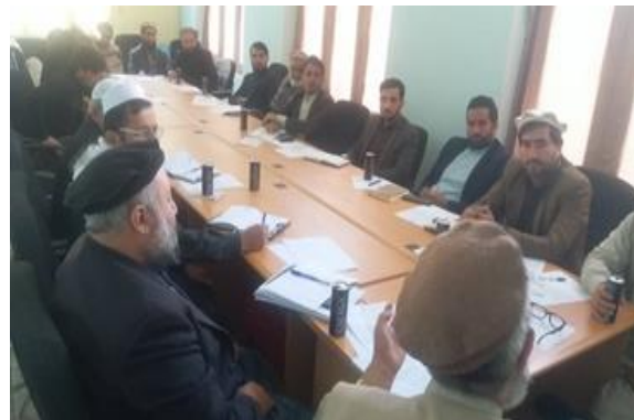
Figure 3 PHCC Meeting in Nuristan PPHD Office