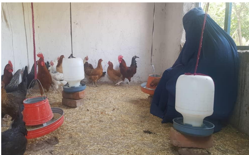
Backyard Poultry Farm in Surkhrod with 25 hens and 5 roosters. The owner has started breeding pullets at home for sustainability of her farm