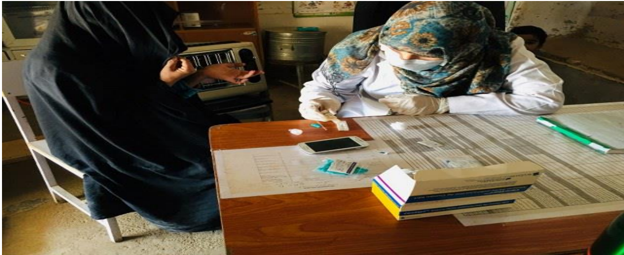
Figure 2: Malaria case management at HF

During the year 2018, ORCD performed 107 effective supervision and monitoring of the project sites and activities, action plans were made and follow-up were done to ensure that the gaps are filled and performance is improved. Also 460 community awareness session conducted in Sarepul and Zabul Provinces, Joint monitoring conducted with UNDP, PPHD, NMLCP, PMLCP and other relevant stakeholders as well. ORCD maintained good coordination with all relevant stockholders at national and provincial level. Also provincial FPs received MLIS Training and the system has been applied at the HFs of Zabul and Sare Pul Provinces.