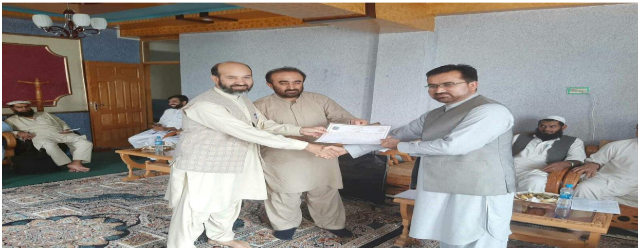
Figure 1 : Our Deputy Project Director for Kunar BPHS/EPHS Project is appreciated by the Provincial Public Health Directorate of Kunar Province for demonstrating excellent management of the project.

As per the work plan of Sehatmandi project, HealthNet TPO/ORCD conducted assessment with the concern of the recruiting, health facilities physical condition, training needs, renovation, medical and non-medical needs, management of the HFs and delivery of health services. In the perspective of the findings of the assessment, a comprehensive plan had been formulated by HealthNet TPO/ORCD since a better implementation needed the entire required supplies were delivered to HFs.