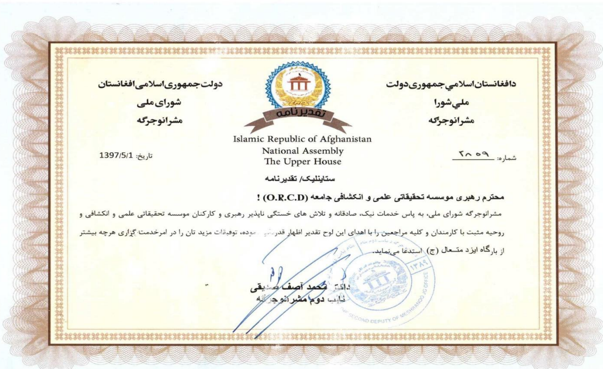
Upper House of the Parliament Appreciating ORCD's activities in Afghanistan