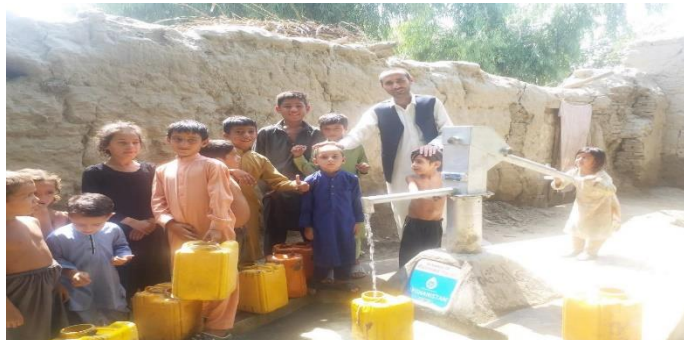
Figure 2 : Deep well constructed in Nangarhar province