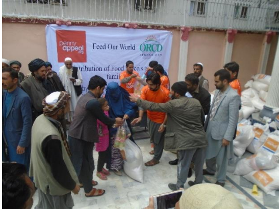
Figure 1: Ramadhan food packages distribution in Kabul

With partnership of Penny Appeal, the project started in on May 01, 2019 and completed on May 30, 2019, objective of project is to meet the food security and nutrition needs of 500 IDP families living in informal settlements of Kabul and Baghlan for 10 days of Ramadhan as a result 300 Ramadhan food parcels in Kabul and 200 food parcels in Baghlan distributed to the targeted families.