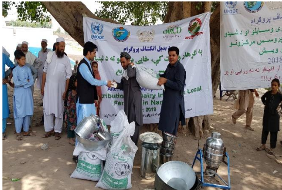
Distribution process of animal husbandry management and dairy processing inputs in Nangarhar

Through rehabilitation of the existing apple orchards and vineyards, the income of local farmers was increased from AFN 45,000 to AFN 55,000 (a 23% increase) in 2019. Additionally, by establishment