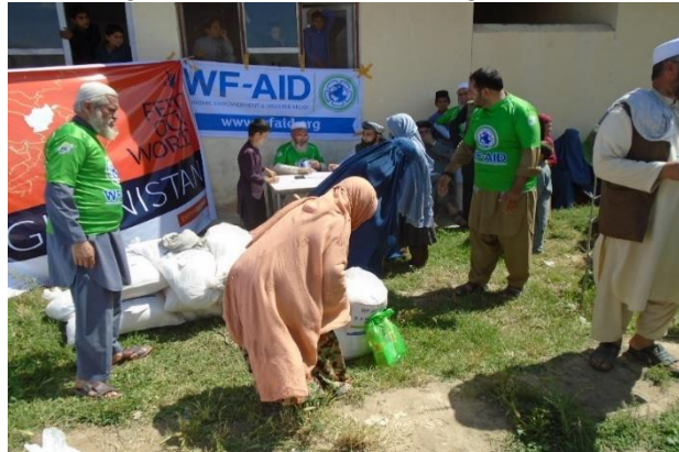
Figure 2: Ramadhan food packages distribution in Baghlan