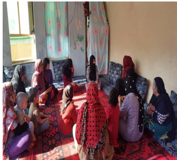
Figure 2 : Baghlan WPC defense lawyer delivering training to clients