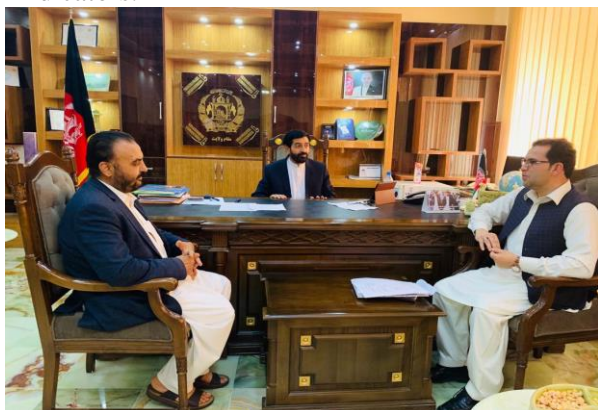
Figure 3 Meeting with Helmand Governor regarding PPP Project Activities in Helmand