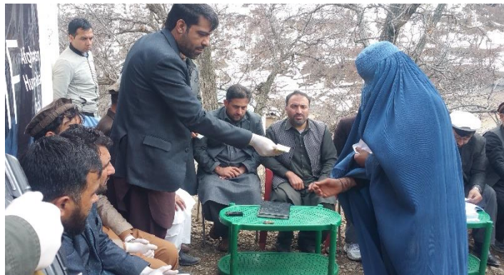
Beneficiary receiving cash-based winterization assistance in Nuristan province

Both Paktika and Nuristan have been considered as Priority 1 Provinces. As indicated by the Joint Winterization Strategy 2019-2020, there are a total 1781 persons in Nuristan and a total 517 persons in Paktika were desperately in direct need of the winterization assistance. Out of this baseline, a total 600 families in Parun of Nuristan and 400 families in Sharana, Urgan and Sarobi of Paktika will be targeted. These targeted households received $ 200 in two equal instalments. The beneficiaries used the assisted amount for procuring means to cope with winter cold such as firewood, blankets, stoves and warm cloths.