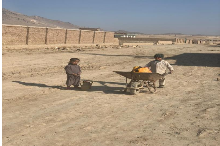
Photo depicting pre-project condition of beneficiaries as small kids used to fetch water in wheelbarrow from more than one KM walk

Through funding from Penny Appeal, ORCD conducted proper need assessment and identified most needed community for this Thirst Relief project. Selection of Butkhak village was done as the area hosted many IDPs and Refugee Returnees household who were in the dire need of safe drinking water. A qualified construction company selected as part of a competitive bidding process, ORCD embarked on implementation of construction of the pipe-scheme (water supply network). The drilling of the deep well began with 16" diameter, 120 m depth and construction of RCC water tank with capacity of holding 15,000 litres of water at a time. Solar panels of 1,400 watts and solar water pumps will be installed for filling the water tank. As per the contract, 8 water taps will be installed for water collection by beneficiaries. Pipe-scheme will be community contribution which the community could establish connection for carrying water to houses living nearby depending on