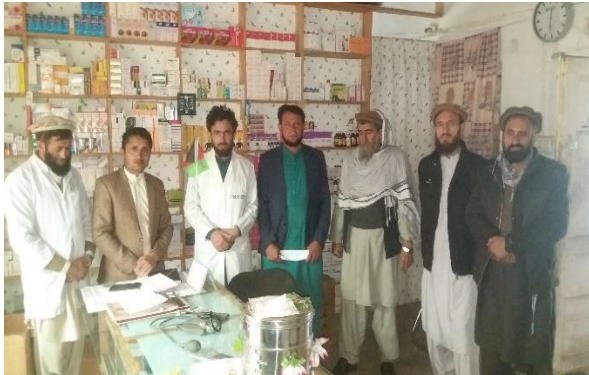
Figure 1: Exposure Visit Est Nuristan Districts PHPs

Through this project, efforts were made aimed at improving the services provided through Private Healthcare Providers by provision of trainings, equipment and medicine to PHPs.