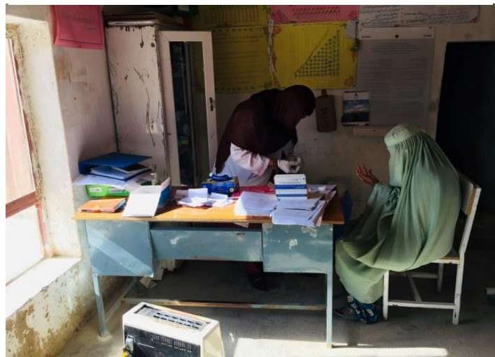
Figure 1: Malaria case management at HF

suspected cases were tested by RDT and microscopy and 237 positive cases were treated by health care providers and Community Health Workers in mentioned provinces. Throughout this year, ORCD conducted the RDT and NTG trainings for health facilities staff, CHSs and CHWs in Sarepul and Zabul provinces. Conducted trainings enabled invited participants to perform effective case management and diagnose of Malaria cases both at health facilities and community level. 120 health practitioners were trained on RDTs