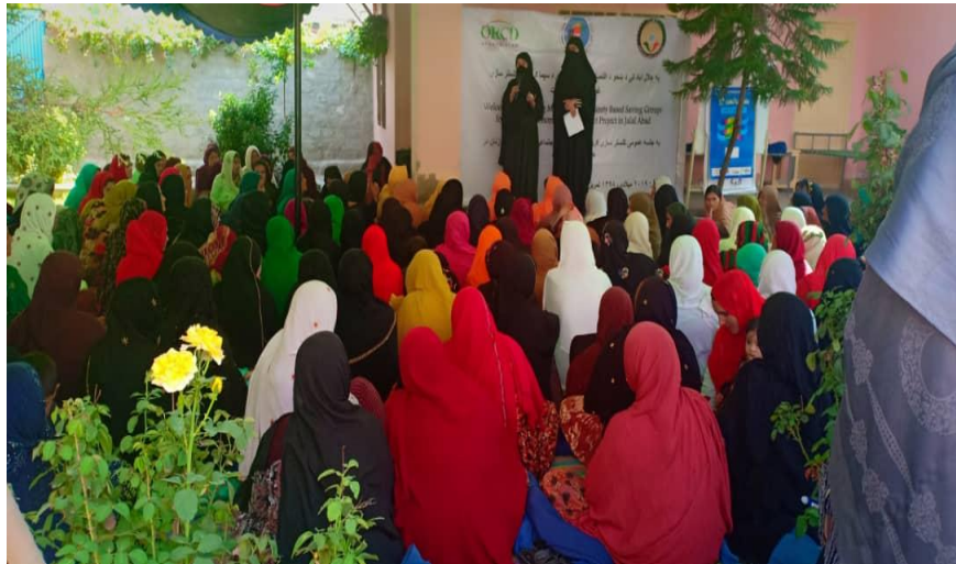
5CBSG members attended leadership skill training in Nangarhar

ORCD has been implementing SWEEP in Jalal Abad through the same approach AKF Afg has been implementing it in Takhar, Badakhshan and Bamyán with the same objective to extend access to finance at grass-roots level. The Community Based Saving Groups (CBSGs) established through this project are comprised of women only from poorest families of the community. CBSG