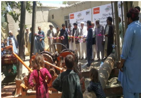
Figure 1 : Construction of Deep wells in Nangarhar Behsod district

In Partnership with penny appeal the project started in April 2019 and ended in Aug 2019. Totally 25 Deep wells constructed in Nangarhar and Baghlan provinces, The direct project beneficiaries are 375 families making 2,625 individuals objective of the project is to increase access of poor and the most venerable people (women and children) to the safe and clean water in order to prevent the transmission of water borne diseases in the targeted communities.