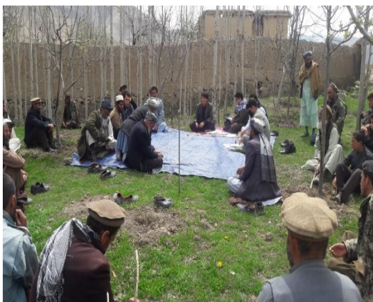
Figure 1: Establishing referral mechanism in Khushkak community

In partnership with IOM ORCD started Community Based Activities (Social and Psychosocial Aspects of Sustainable Reintegration) of RADA Project in Balkh Province. The overall Goal of the project is: To contribute to the progressive achievement of Sustainable Development Goal (SDG) 10.7, “to facilitate orderly, safe, regular, and responsible migration and mobility of people including through the implementation of planned and well-managed policies”. The specific objective of the project is: To support Afghan returnees, their families and host communities towards sustainable reintegration in Afghanistan.