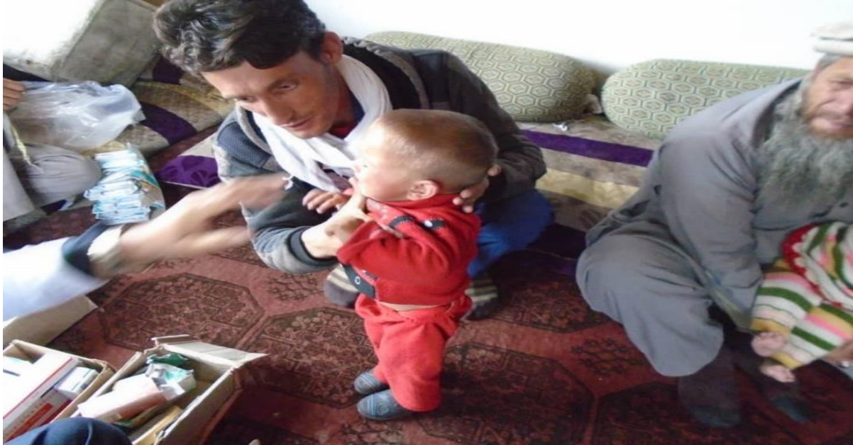
Figure 2: Examining Patient by Doctor

Totally, 3635 under 5 children were screened for malnutrition, 1094 children were referred for treatment, 523 children were enrolled in MAM program, IYCF counseling were done to 10,576 PLWs from January to the end of August 2019.