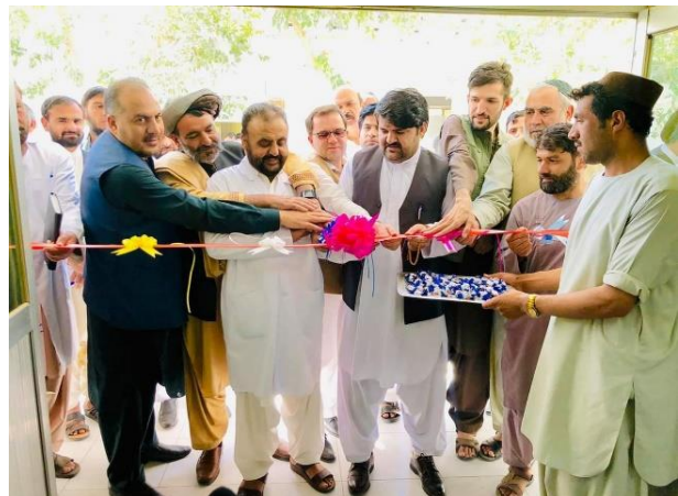
Figure 1 Inauguration of Helmand New PHCC Meeting Hall

All incentives paid to PHPs were calculated based on achievement of proxy indicators against baseline indicators.