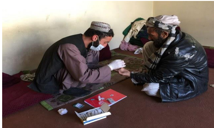
Figure 3 : CBMM in Zabul Province-Health Post

The main challenge towards implementation of the project was instable -and even deteriorated- security situation, in both provinces, as for almost one quarter all HFs were closed by AOG in Zabul Province that after community negotiation and mediation the HFs reopened. Having effective risk mitigation plan and community support, ORCD succeeded to overcome the challenge and reach the target communities.