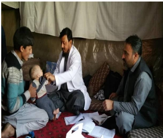
Figure 2 :Measuring MUAC of Baby

In the view of this, the nutrition mobile teams tackled both supply side and demand side factors. On demand side aspect, they strengthened community-based nutrition interventions i.e. increased case