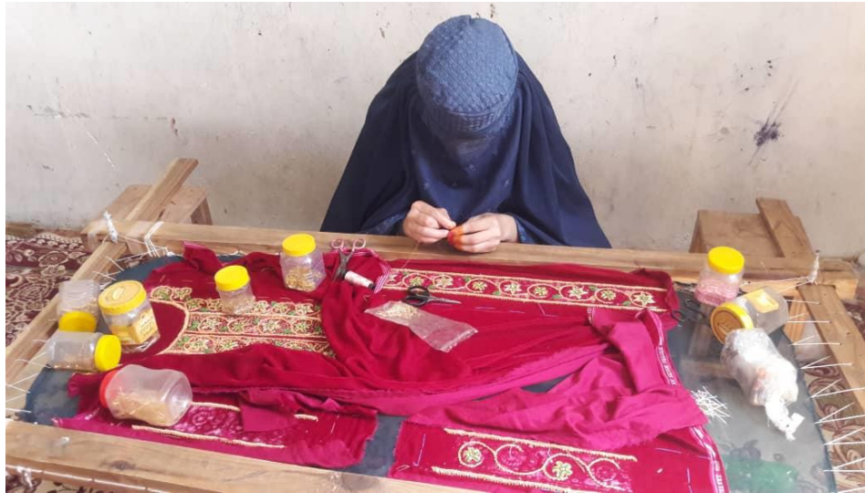
A CBSG member generating livelihood income form the loan she received form CBSG saving committee

All 405 members of the 25 CBSGs established in Jalal Abad have held meetings regularly on weekly basis, have made regular savings and have discussed issues around their roles and responsibilities, norms, potential business ideas and etc. Some of CBSGs have also extended loans to members for various purposes ranging from