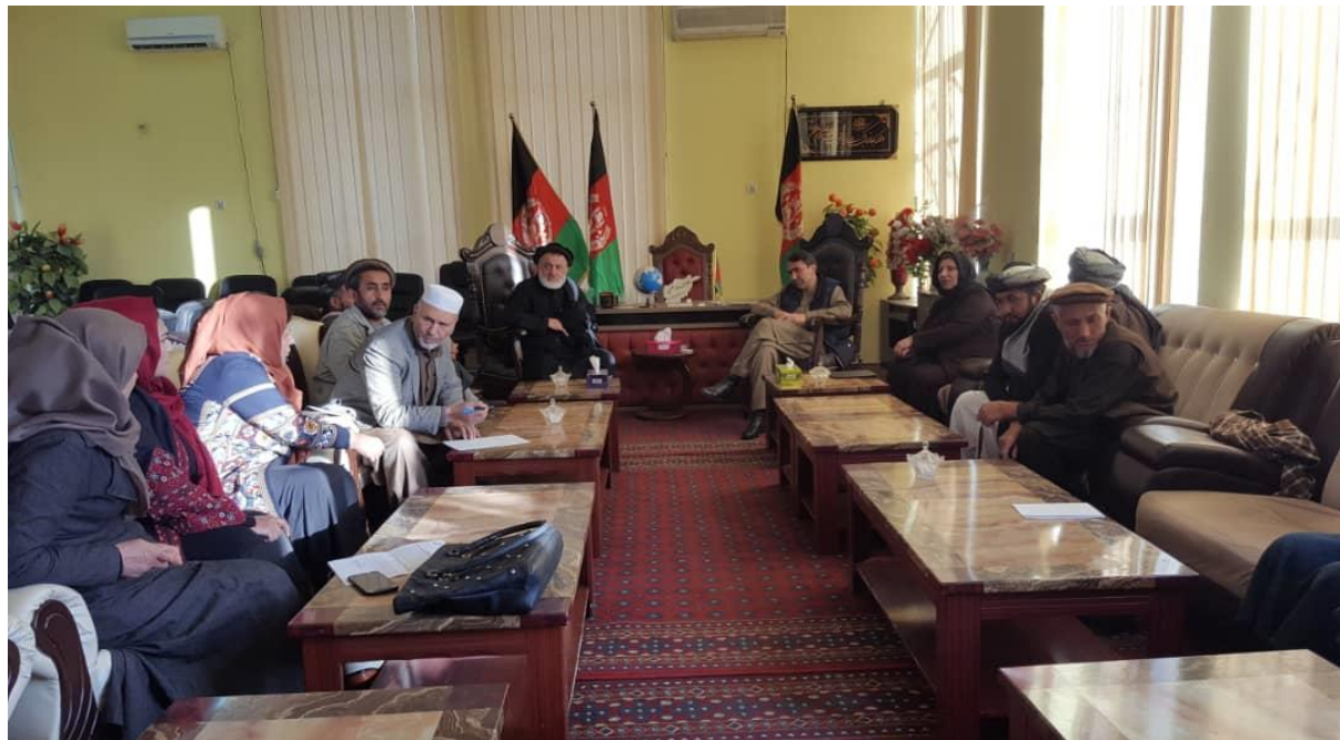
Figure 2 Baghlan WPC staff meeting with head of provincial councils