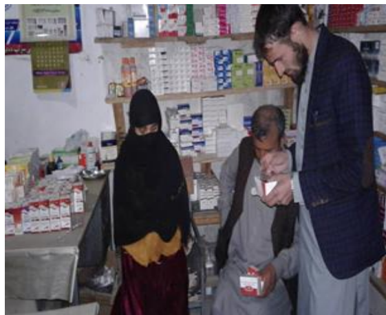
Figure 2 PHP Monitoring Visit