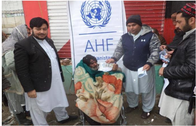
Beneficiary receiving cash assistance in Paktika province

Through AHF funding under OCHA, ORCD enacted a 6 months agreement to provide Cash-based winterization assistance to 900 IDP and conflict affected population in Paktika and Nuristan provinces. The contract agreement started November 15, 2019 to May 14, 2020. The proposed project which is in line with the Humanitarian Response Plan (HRP) for 2019 (addressing SO1 and SO2) was implemented in Nuristan & Paktika provinces which both of them are included in the priority 1 provinces of the ES/NFI cluster as highlighted in Joint Winterization Response Strategy. The project's overall objective was to improve well-being of the target vulnerable people to meet their immediate survival needs winterization assistance so that they can withstand harsh winter. The project directly contributed to the strategic objective 1 and 2 of Humanitarian Response Plan 2018-2021 which focuses on: SO1: Lives are saved in the areas of highest need and; (SO2) People by sudden and slow-onset crises are provided with a timely response.