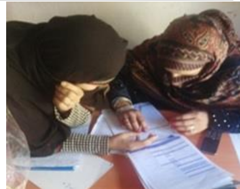
Figure 1: PHP Monitoring Visit

Additionally, monthly incentives were paid to Private Health Practitioners based on their achievements.