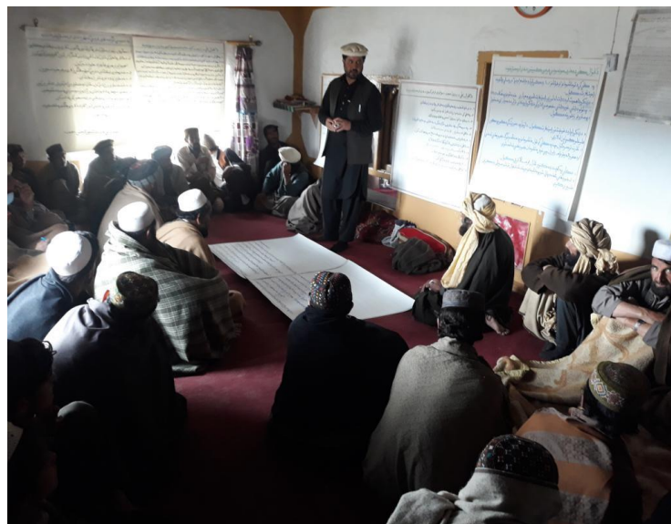
Yahya khel Gulowal subcommittee formation In Paktika province

In 2019, ORCD continued facilitation of Citizens' Charter in 92 of 181 contracted communities by engaging target communities in community profiling, CDC elections, CDC registration and bank account opening, development of community development plans, mapping community resources, social patterns and women mobility. Additionally, baseline institutional maturity index assessments of all elected CDCs were conducted, Community Score Cards were implemented and all essential trainings i.e. CDC bylaws, CDC office-bearers roles and responsibilities, community procurements, financial management, project cycle management, community score card and etc.