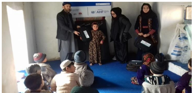
Figure 1: Student Kit Distribution in CBS at Qaldaw Village of Shortepa District of Balkh Province

The project established and supported 100 CBE classes facilitated by 100 teachers with priority to hire and train more female teachers (at least 60% female teacher). Through this project IRW and partners (ORCD, AGHCO, RET Germany) targeted around 200 villages where IDPs and