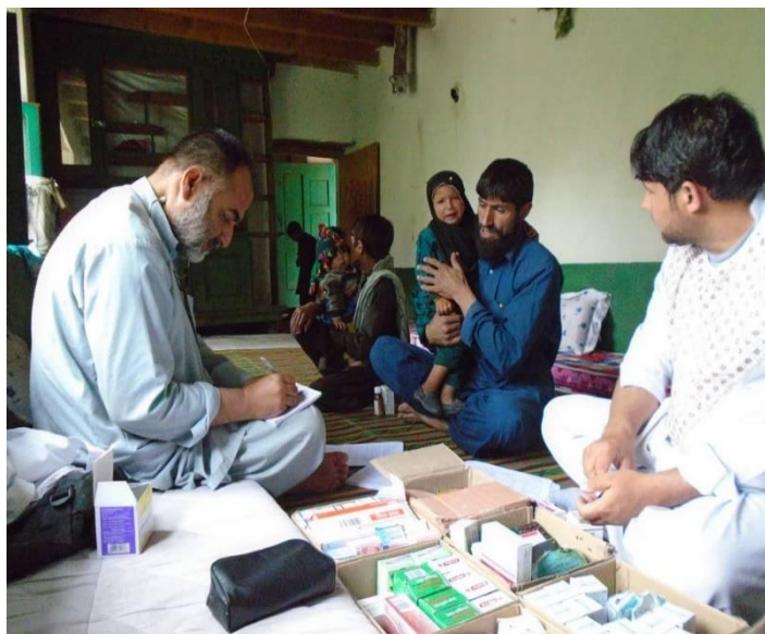
Figure 1 Writing Prescription for patient

ORCD deployed staff as per guidelines introduced by MoPH for two mobile nutrition teams (1 midwife, nutrition officer and support staff) serving underserved areas in the districts (Gosfandi, Sancharak, Sarepul, and Sozma Qala). The mobile nutrition teams worked in the areas beyond the reach of the existing health facilities as part of nutrition mobile activity. The mobile teams were greatly needed because the existing BPHS did not have any mobile health team while there was drought affected population who needed especially nutrition. In the view of this, two standalone mobile nutrition teams were greatly needed. The mobile teams were established as part of this project which chiefly provided nutrition services integrated with health under BPHS program. The mobile nutrition teams greatly complemented the existing BPHS program in tackled the nutrition need of the drought affected population in the target districts.