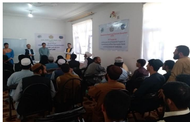
Figure 2 HMIS/IP Training in Farah Province